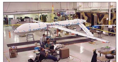
▲ Ground vibration test

"The ability to use multiple tools in a tightly integrated fashion lets the engineers focus their efforts on the design issues, resulting in faster, better solutions."